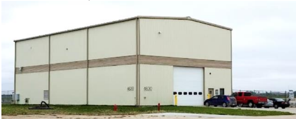
MwRSF Vehicle Preparation Center at the MwRSF Outdoor Test Site 4630 NW 36 th Street, Lincoln, NE – at the Northwest Corner of Lincoln Airport