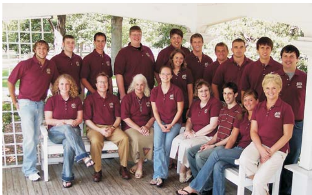
Summer interns and staff for P3 in 2006