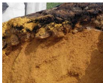
One storage method demonstrated was straight modified wet distillers grain in a bunker covered with plastic. One month later, an outer crust had formed, yet product below the crust was still good quality.

Nebraska, this program provided professional development for extension educators and feed industry professionals with full-scale demonstrations at the feedlot at the Center. This program, supported by a Professional Development Program (PDP) grant from the North Central Region SARE, had the goal of teaching educators how wet ethanol co-products can be used in small-scale cattle operations. Experts from Nebraska, Iowa, Kansas, South Dakota, Missouri, and Colorado presented their research, experience, and observations on storage of co-products.