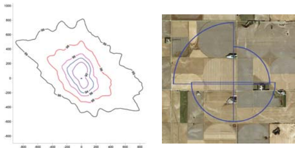
On the left is an example output from the odor modeling. This output is then converted into the OFT setback distances (on the right) by taking the longest distance in each sector to give an easy-to-visualize footprint for the odor drift from a livestock operation. The blue lines represent the minimum separation distance for a specific odor tolerance level.